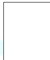
immediate person photo

20. Brothers/Sisters who are schooling or working.